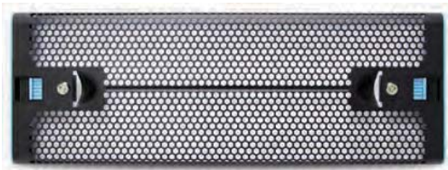
Optional item - Front door

36 x 3.5" hot swap tool-less drive trays (fits 2.5" drives with use of screws)