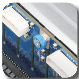
Tool-less backplane installation