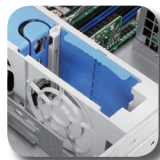
Air baffle to prevent air circulation