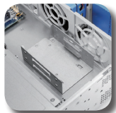
Optional 2-bay 2.5" HDD cage