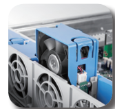
Hot-swap fan module