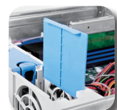
Air baffle to prevent air circulation