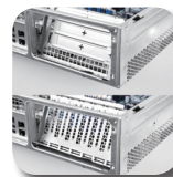
Easy-swap 3-slot or 7-slot rear window (Option)