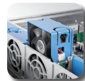
Hot-swap fan module