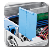
Air baffle to prevent air circulation