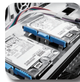
Tool-less 2.5" HDD mounting kit